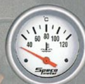
2 5/8" 537-30 40-120°C elect water temp white dial-silver bezel includes sender