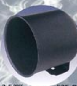
2 5/8" 535-00 black steel mount pod