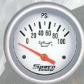
2 5/8" 537-20 100 psi elect oil press white dial-silver bezel includes sender