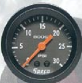
2" 533-05 30psi boost gauge (w/ vac) black dial-black bezel