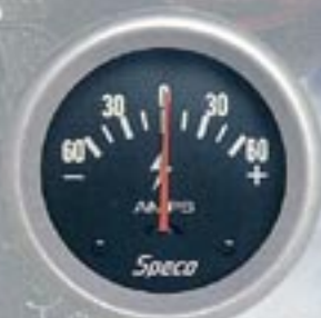
2 5/8" 535-51 60-0-60 amp ammeter black dial-silver bezel