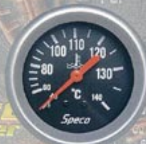
2 5/8" 535-24a mech water temp - 12' capillary includes 4 adaptors