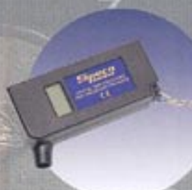
Speco Meter 510-00 digital tyre pressure gauge inc tread depth function