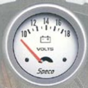
2 5/8" 537-22 10-18 voltmeter white dial-silver bezel