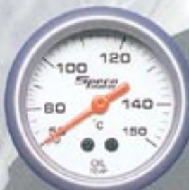
2" 524-15 50-150°C mech oil temp silver dial-silver bezel