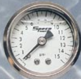
1 1/2" 512-16 0-15psi liquid filled fuel press mech fuel press-carburetors white dial - chrome housing