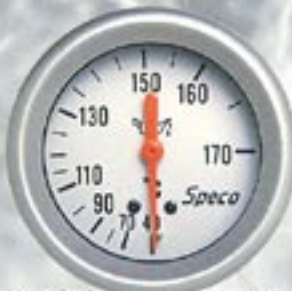
2 5/8" 537-15 40-170°C mech oil temp white dial-silver bezel