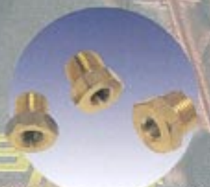
adaptor 542-21 1/8 NPT x M14-L5 elec oil gauge adaptor 542-22 1/8 NPT x M16-L5 elec oil gauge adaptor 542-23 1/8 NPT x M18-L5 elec oil gauge adaptor 542-24 1/8 NPT x M12-L5 elec oil gauge adaptor 542-25 1/8 NPT x 1/4 NPT elec oil gauge