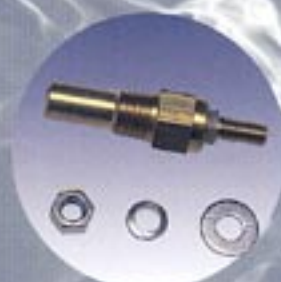
Sender 545-30 temperature (electric) 1/8" NPT