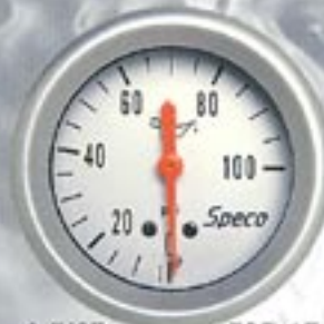
2 5/8" 537-17 mech oil press - 12" line white dial-silver bezel