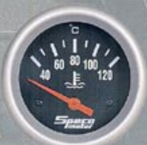
2 5/8" 535-30 40-120°C elect water temp black dial-silver bezel includes sender