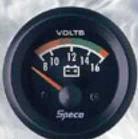
2" 523-22 8-16 voltmeter black dial-black bezel