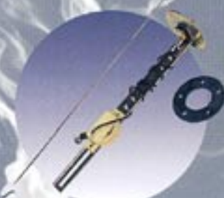
Sender 545-40 fuel level (adjustable) for 523-06/524-06/535-06/537-06 gauges