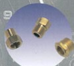
adaptor 544-31 5/8 UNF x M16-L5 mach water temp adaptor 544-32 5/8 UNF x M18-L5 mach water temp adaptor 544-33 5/8 UNF x 1/2" NPT Holder 3/8 & 3/8 Chev. adaptor 544-34 5/8 UNF x 1/8" NPT Ford & Chrysler V8 adaptor 544-35 5/8 UNF x 5/8 UNF lined with O ring seal