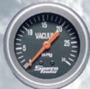
2 5/8" 535-10 0-30 in Hg vacuum black dial-silver bezel