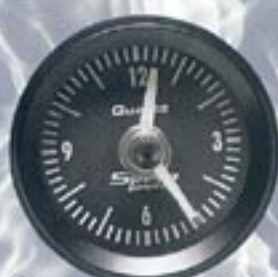
2" 523-03 electric clock (12 volt) black dial-black bezel