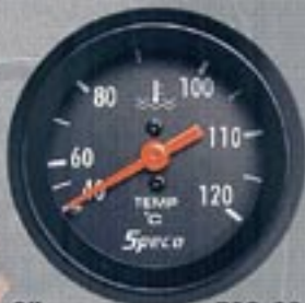
2" 533-23 40-120°C mech water temp no adaptors included