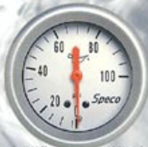
2 5/8" 537-16 100 psi mech oil press white dial-silver bezel