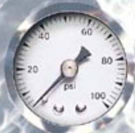
1 1/2" 512-20 0-100psi mech fuel press for fuel injection white dial - chrome housing