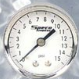
1 1/2" 512-15 0-15psi mech fuel press white dial - chrome housing