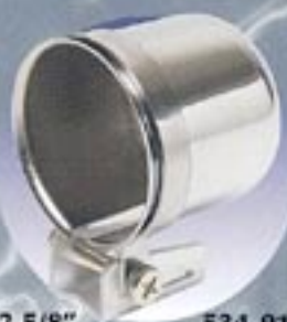
2 5/8" 534-91 chrome steel pod - clamp type