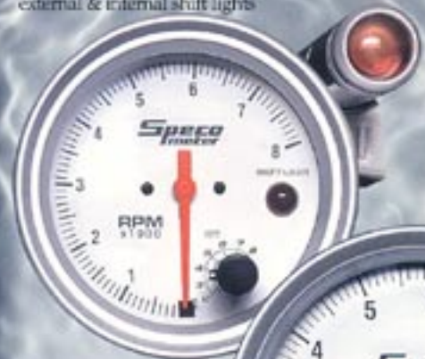
4" 520-18 white dial shift light tacho 0-8000rpm external & internal shift lights