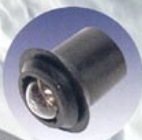
Light Bulb 550-01 light bulb assembly 14mm 2" mech & all 2 5/8" gauges