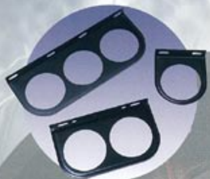
2" single black panel 541-01 2" double black panel 541-02 2" triple black panel 541-03