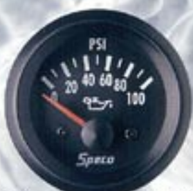
2" 523-16 0-100 psi elect oil press includes sender