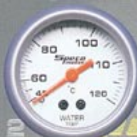
2" 524-23 40-120°C mech water temp silver dial-silver bezel