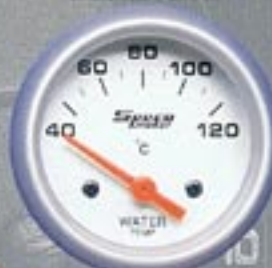
2" 524-30 40-120°C elect water temp silver dial-silver bezel includes sender