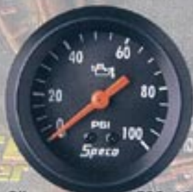
2" 533-16 100 psi mech oil press black dial-black bezel