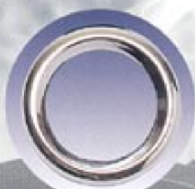
2 5/8" 548-01 chrome clip on bezel