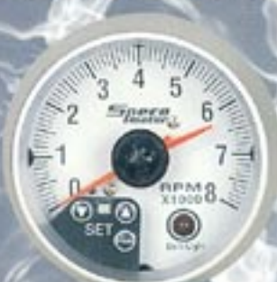
3 3/4" 520-15 white dial shift light tacho "touch-set" calibration