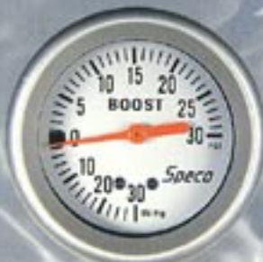
2 5/8" 537-04 30 psi vac/boost gauge white dial-silver bezel