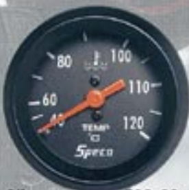
2" 533-23a 40-120°C mech water temp includes 4 adaptors