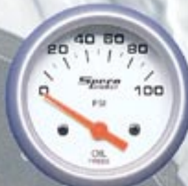
2" 524-20 100psi electric oil press silver dial-silver bezel includes sender