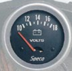
2 5/8" 535-22 10-18 voltmeter black dial-silver bezel