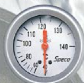
2 5/8" 537-23 40-140°C mech water temp white dial-silver bezel