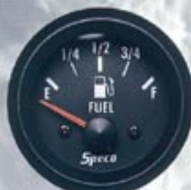
2" 523-06 fuel level gauge & sender black dial-black bezel