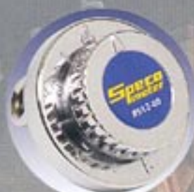
Speco Meter 512-00 fuel pressure regulator 1-6psi inc 5/16 & 3/8 fittings