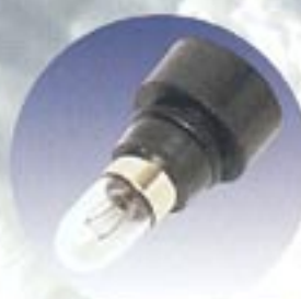
Light Bulb 550-02 light bulb assembly 7mm 2" electric gauges