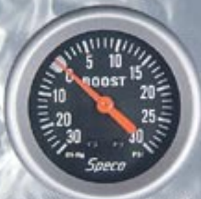
2 5/8" 535-04 30 psi vac/boost gauge black dial-silver bezel