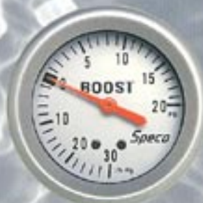
2 5/8" 537-03 20 psi vac/boost gauge white dial-silver bezel