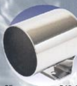
2" 540-00 chrome steel mount pod