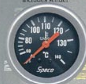
2 5/8" 535-24 mech water temp - 12' capillary black dial-silver bezel