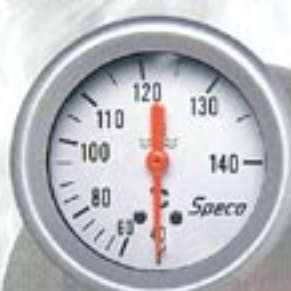
2 5/8" 537-23a 40-140°C mech water temp includes 4 adaptors