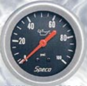
2 5/8" 535-16 100 psi mech oil press black dial-silver bezel