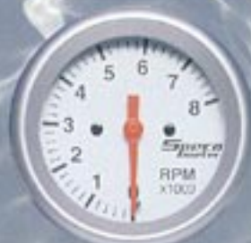
2 5/8" 520-02 white dial - silver bezel 0-8000 rpm - in dash