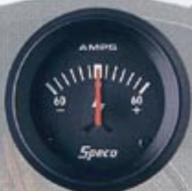
2" 523-51 60-0-60 amp ammeter black dial-black bezel