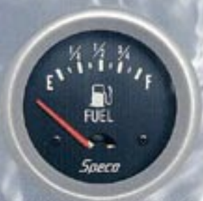
2 5/8" 535-06 fuel gauge & sender black dial-silver bezel