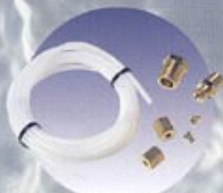
Pressure Gauge Fitting Kit 546-40 6' nylon line oil pressure gauge 6' nylon line oil pressure gauge 546-50 12' nylon line oil pressure gauge 546-55