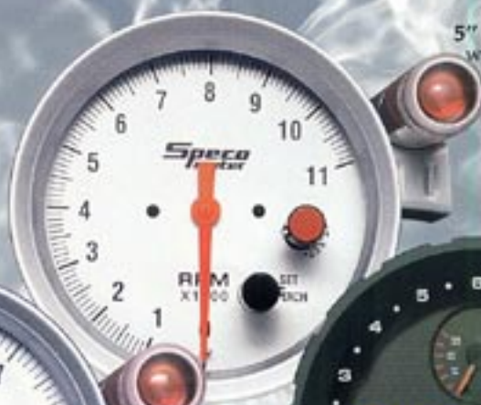
5" 520-20 white dial shift light tacho 0-11000rpm external shift light