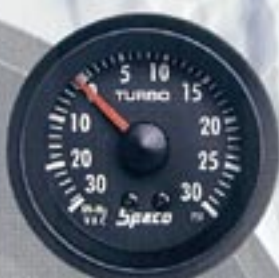
2" 533-03 30psi vac/boost gauge black dial-black bezel