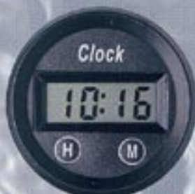
2" 523-02 digital clock (12 volt) black dial-black bezel