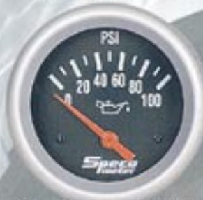
2 5/8" 535-20 100 psi elect oil press black dial-silver bezel includes sender