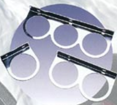
2 5/8" single chrome panel 541-08 2 5/8" double chrome panel 541-09 2 5/8" triple chrome panel 541-10