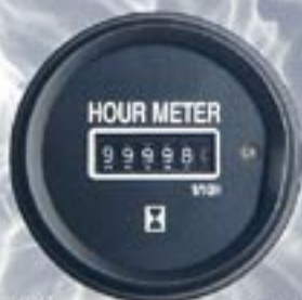
2" 523-01 hour-meter (12/24 volts) black dial-black bezel