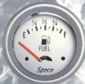
2 5/8" 537-06 fuel gauge & sender white dial-silver bezel