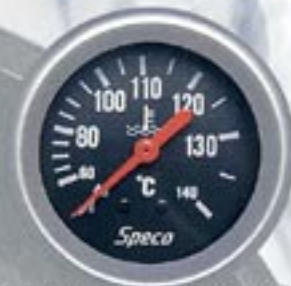
2 5/8" 535-23 40-140°C mech water temp black dial-silver bezel