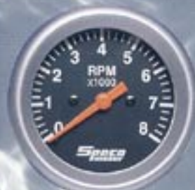
2 5/8" 520-01 black dial - silver bezel 0-8000 rpm - in dash