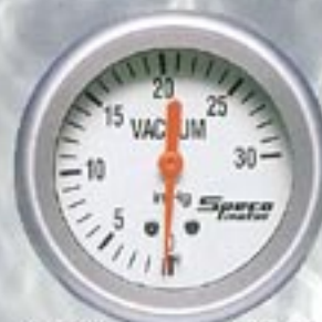
2 5/8" 537-10 0-30in Hg vacuum white dial-silver bezel