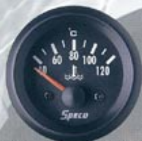
2" 523-23 40-120°C elect water temp black dial-black bezel includes sender