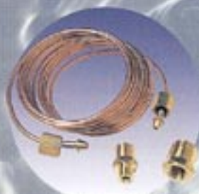
Pressure Gauge Fitting Kit 546-60 6' copper line oil pressure gauge 546-60 12' copper line oil pressure gauge 546-65