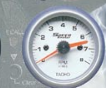
2" 524-01 silver dial/silver bezel 8000 rpm - in dash