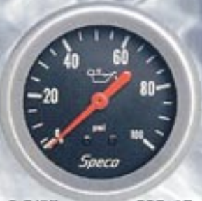
2 5/8" 535-17 mech oil press - 12' line black dial-silver bezel