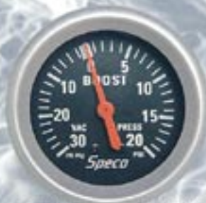
2 5/8" 535-03 20 psi vac/boost gauge black dial-silver bezel