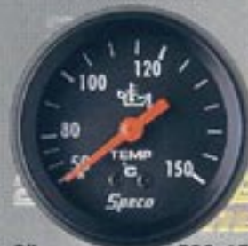
2" 533-15 50-150°C mech oil temp black dial-black bezel