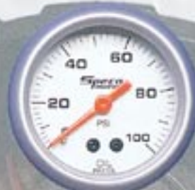
2" 524-16 100psi mech oil press silver dial-silver bezel