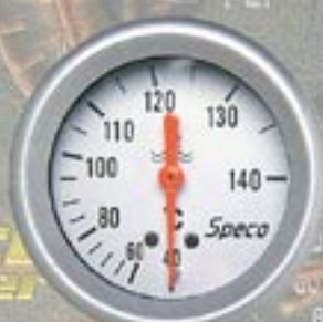
2 5/8" 537-24a mech water temp-12" capillary includes 4 adaptors