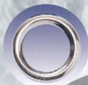
2" 548-00 chrome clip on bezel