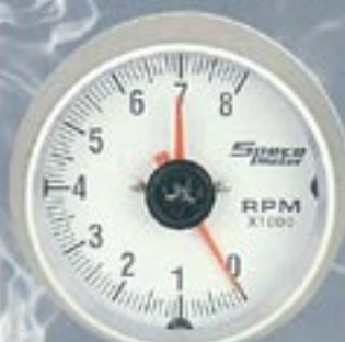
3 3/4" 520-16 white dial tacho 0-8000rpm