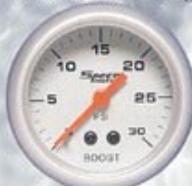
2" 524-05 30psi boost gauge (no vac) silver dial-silver bezel