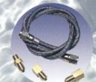
3 feet 546-70 braided line kit dash/ remote mount gauges