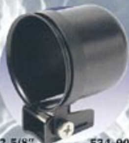
2 5/8" 534-90 black steel pod - clamp type