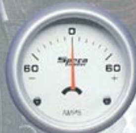
2" 524-51 60-0-60 amps ammeter silver dial-silver bezel