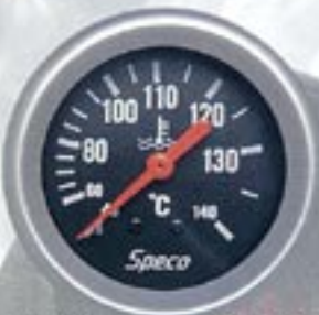
2 5/8" 535-23a 40-140°C mech water temp includes 4 adaptors