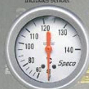
2 5/8" 537-24 mech water temp-12" capillary white dial-silver bezel