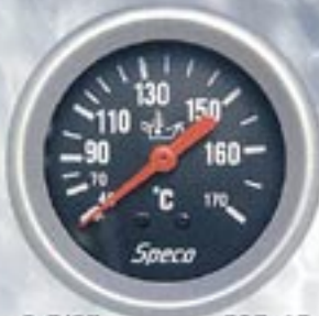
2 5/8" 535-15 40-170°C mech oil temp black dial-silver bezel