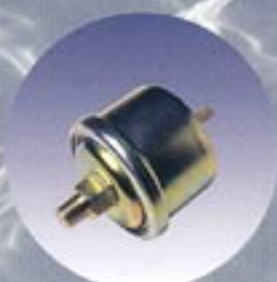
Sender 545-20 oil pressure (electric) 1/8" NPT