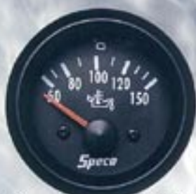
2" 523-15 50-150°C elect oil temp includes sender