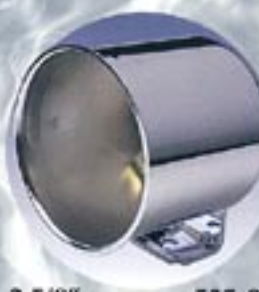
2 5/8" 535-01 chrome steel mount pod