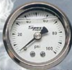
1 1/2" 512-21 0-100psi liquid filled fuel press mechanical fuel pressure white dial - chrome housing