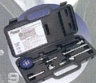
Speco Meter 510-20 digital tyre gauge set 0-15psi board with 4 adaptors