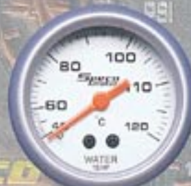
2" 524-23a 40-120°C mech water temp includes 4 adaptors