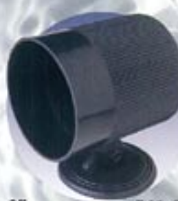
2" 541-00 black plastic mount pod