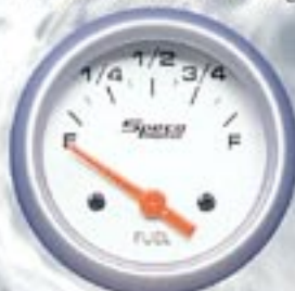
2" 524-06 fuel gauge and sender silver dial-silver bezel